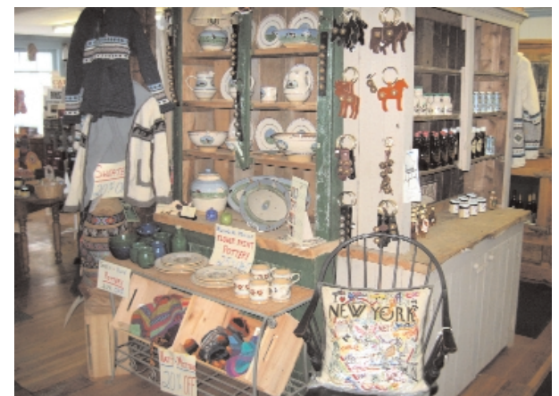
Photos clockwise from left: F.H. Gillingham & Sons in Woodstock, Taftsville Country Store on Route 4, between Woodstock & Quechee, A look inside South Woodstock Country Store.

milk cheeses from Thistle Hill Farm and Cobb Hill Cheese, who together monopolize the blue ribbon for best farm cheese at the American Cheese Society competition. Also try Bailey Hazen Blue from Jasper Hill Farm, and dozens of others. Select a complementary wine from 130 well-priced offerings and be sure to greet the "store managers," golden retrievers Annie and Ruby. continued on page 5